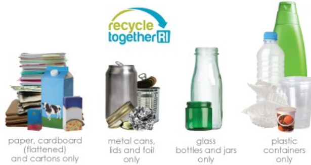
paper, cardboard (flattened) and cartons only